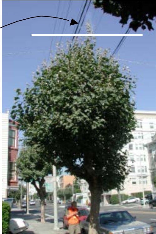
Figure A.2. Example of Tree with Erratic Leader

Tree height measurement. Measure to white line.