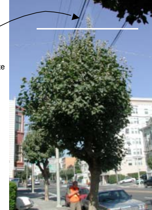
measurement. Measure to white line.