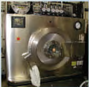
A carbon dioxide (CO 2 ) cleaning system

Qualifying technologies are those that are non-toxic and non-smog forming. To date, ARB has determined that wet cleaning (including professional wet cleaning) and CO 2 systems meet this criteria.