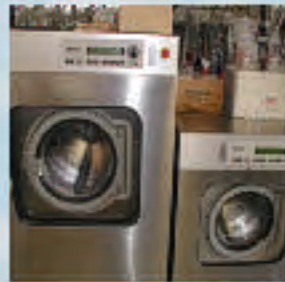
A water-based cleaning system