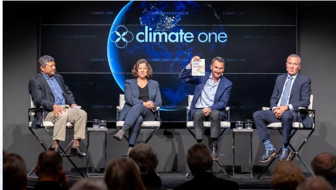
Climate One event November 2018