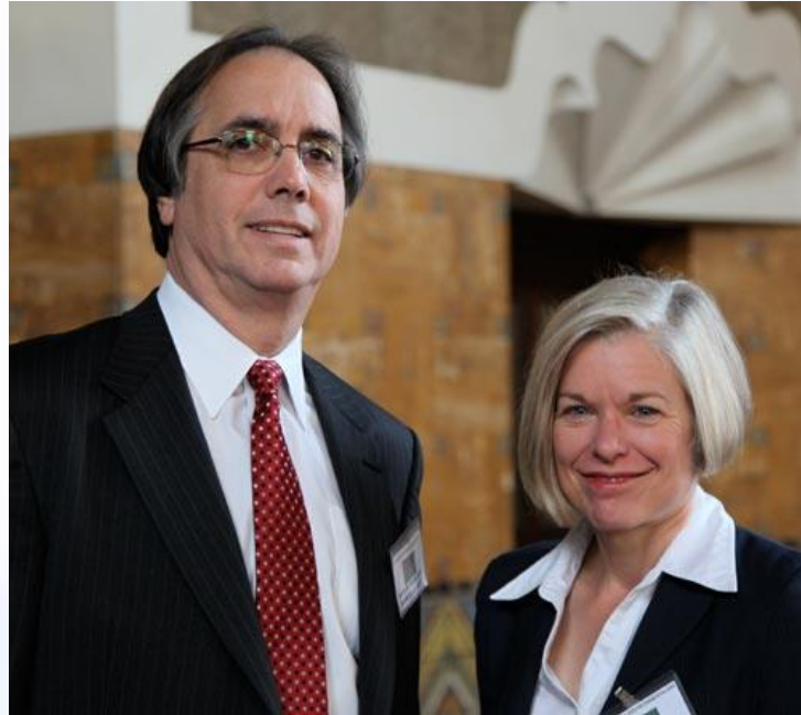
U.S. EPA Environmental Awards 2010