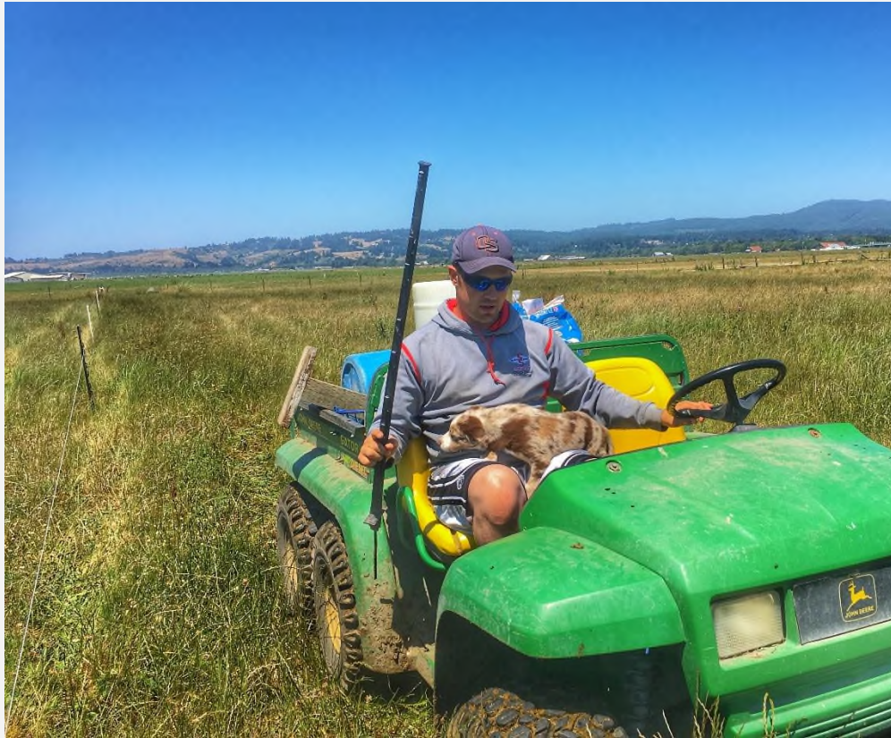
Seasonal strip grazing