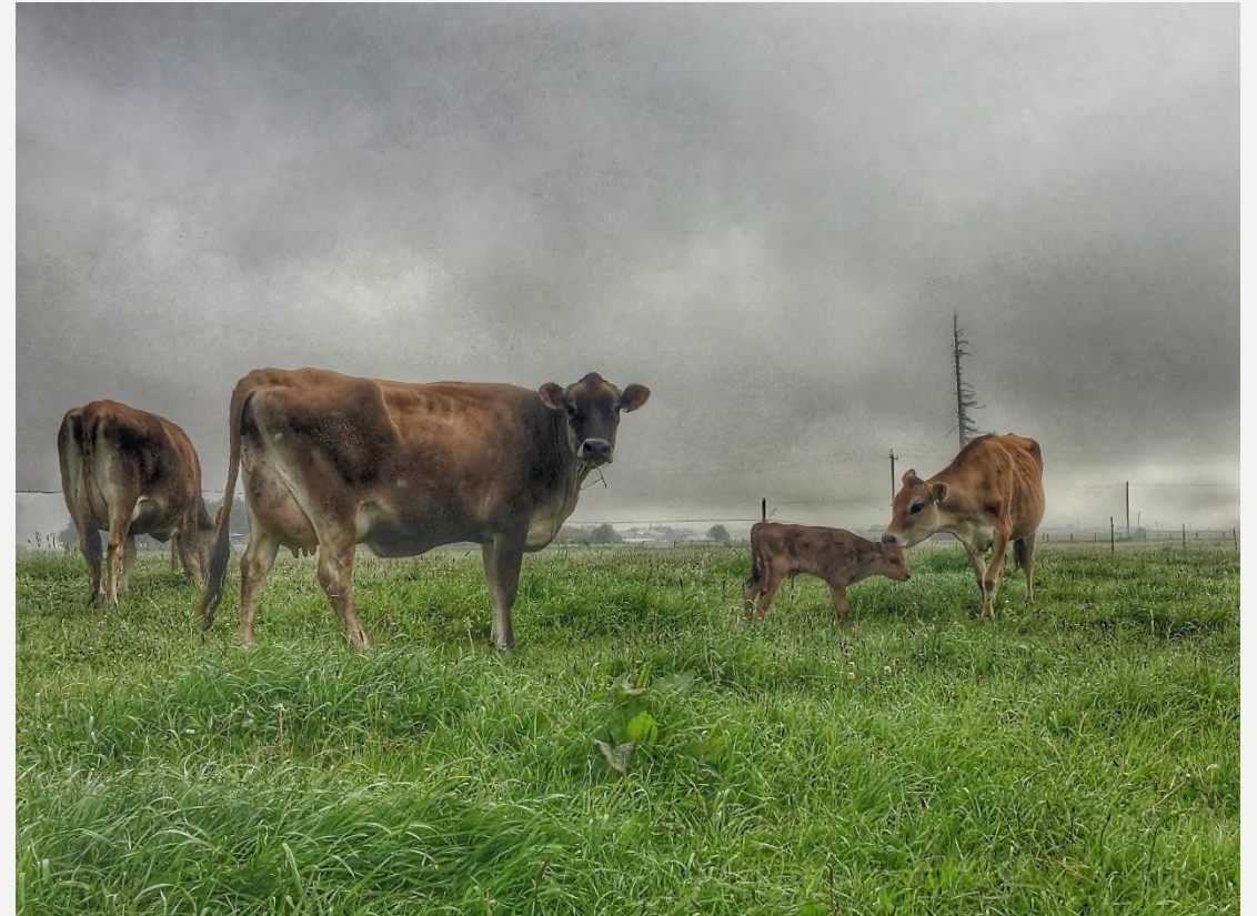
Winter grazing on rotational pastures