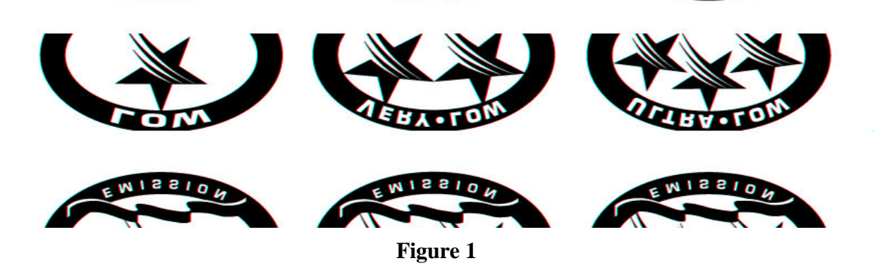
(NOTE: Labels are not to scale.)

(1) Facsimiles of the label format are shown in Figure 1.